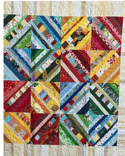
Top: Sandra Dauer